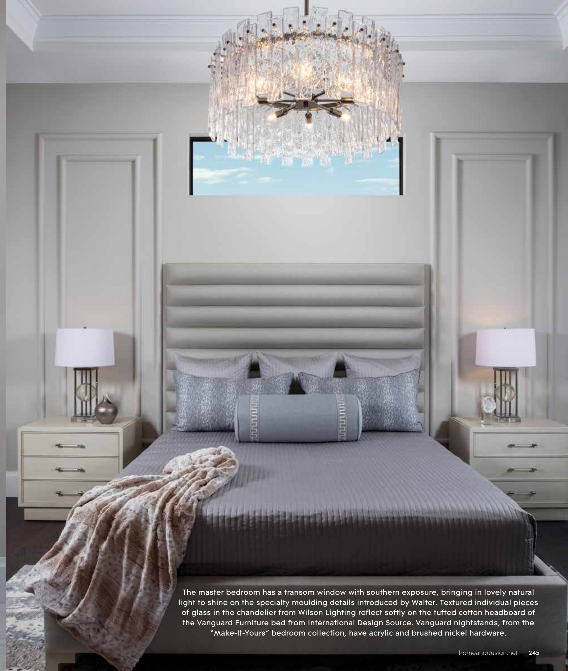
The master bedroom has a transom window with southern exposure, bringing in lovely natural light to shine on the specialty moulding details introduced by Walter. Textured individual pieces of glass in the chandelier from Wilson Lighting reflect softly on the tufted cotton headboard of the Vanguard Furniture bed from International Design Source. Vanguard nightstands, from the "Make-It-Yours" bedroom collection, have acrylic and brushed nickel hardware.