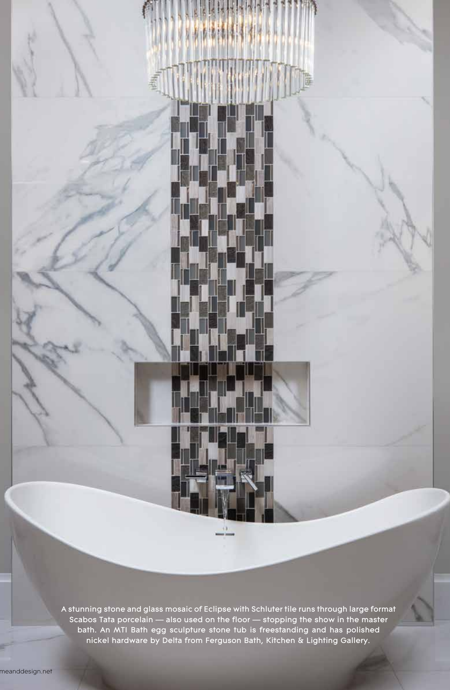
A stunning stone and glass mosaic of Eclipse with Schluter tile runs through large format Scabos Tata porcelain — also used on the floor — stopping the show in the master bath. An MTI Bath egg sculpture stone tub is freestanding and has polished nickel hardware by Delta from Ferguson Bath, Kitchen & Lighting Gallery.